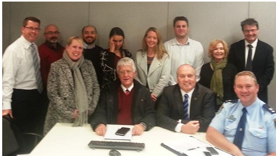
(Members of the Hills Youth Suicide Task Force)

The aim of the Hills Youth Suicide Task Force is to eliminate youth suicide in the Hills by raising awareness and eradicating the stigma surrounding mental health.