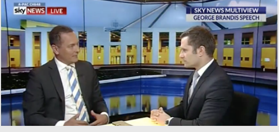
(Sky AM Agenda 24.2.16)